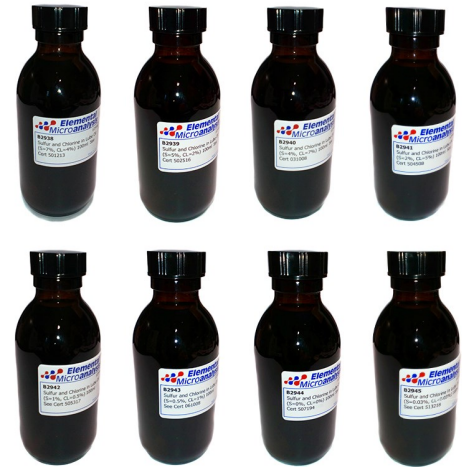
B2938-B2945 sulfur and chlorine in lube oil