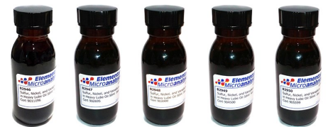
B2938-B2945 sulfur, nickel and vanadium in heavy lube oil